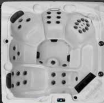
SERENITY COVE 5

Size: 82" x 82" x 39" Jets: 42 Orion SS Jets Gallons: 295