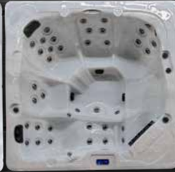
CABANA BAY 5

Size: 92" x 92" x 39" Jets: 42 Orion SS Jets Gallons: 425