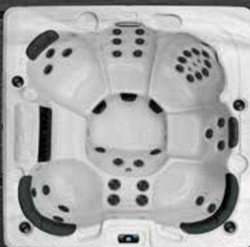
TRANQUILITY HARBOR 7

Size: 60" x 82.5 x 33.5" Jets: 36 Orion SS Jets Gallons: 160