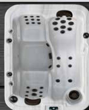
SUNSET COVE 3

Size: 78" x 78" x 36" Jets: 30 Orion SS Jets Gallons: 280