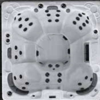
OCEAN BREEZE 7

Size: 82" x 82" x 39" Jets: 42 Orion SS Jets Gallons: 295