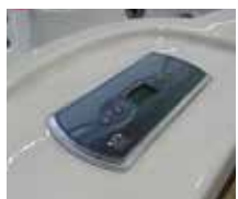
506 Topside Control